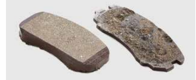
Figure 2. Counterfeit brake pad is light-weighted but bulky, showing rough cuttings with unevenness to colors inside

*Image above: See the difference on compound materials of genuine and counterfeit parts