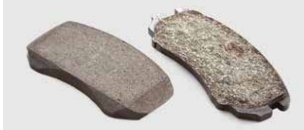
Figure 1. Genuine brake pad is rather compressed in size but heavy, showing smoother cuttings with well-defined colors inside